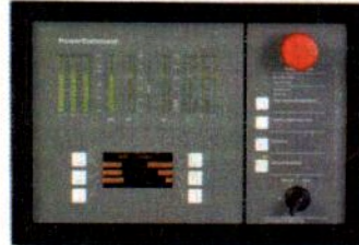
Optional features shown